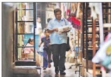
PLEASE MR POSTMAN...

Surprised? Dharavi is home to several thriving small-scale industries such as embroidered garments, leather goods, pottery and plastic. According to reports, Dharavi's