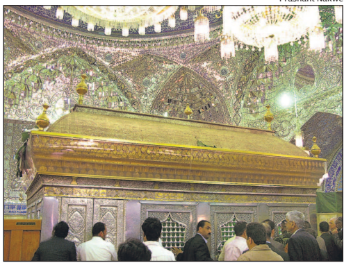
The Great Mosque at Kufa

When Bohras floated the idea of rebuilding the mosque, Saddam was still in power and the 11-year project only got difficult after the 2003 American invasion. “People don't understand how difficult it was